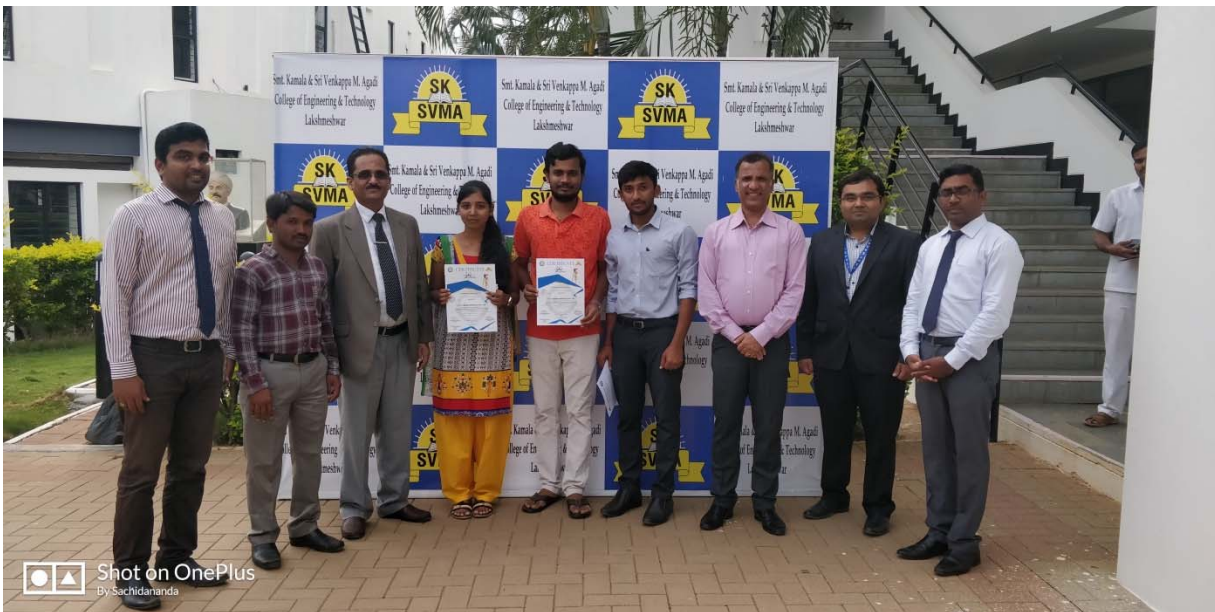
MoU and Certification at Valedictory Function

Faculties of Civil Engineering Department also trained one day as a part of training of trainers (ToT) programme, which is one of the objective in our skill development and entrepreneurship.