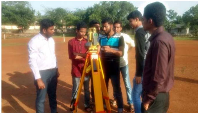
Hands-on Session in Field