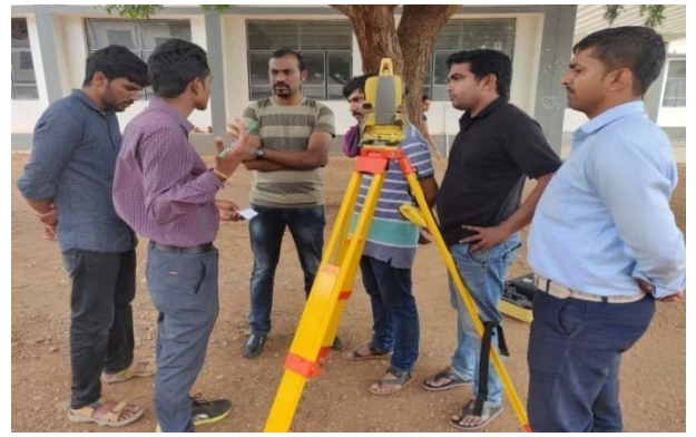
Training for Faculties